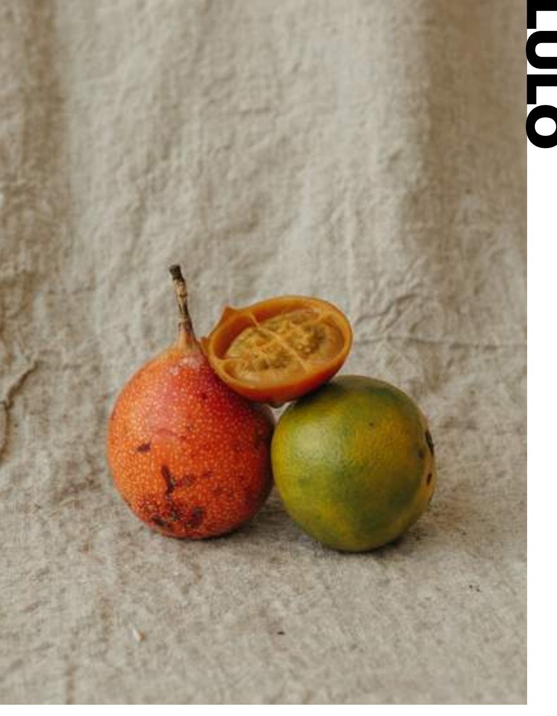
What: Known as naranjilla in other South American countries, this fruit is sold on the street—locals eat the flesh from its four quadrants with a spoon—or often served as juice.

Where: At Alquimico, a craft cocktail bar that would feel at home in Brooklyn, New York the La Amargura drink is made with Iulo and pineapple-infused rum.